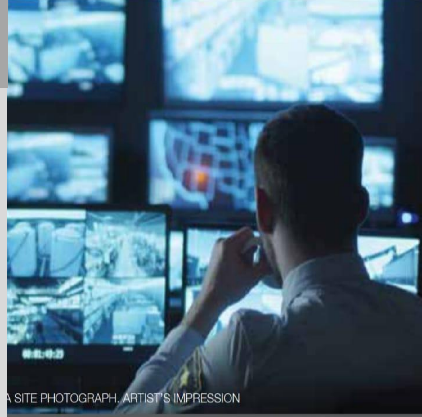
A SITE PHOTOGRAPH. ARTIST'S IMPRESSION